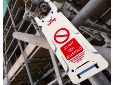
Scafftag® Scaffold Management