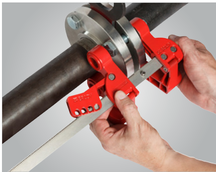
Blind Flange Lockout Devices