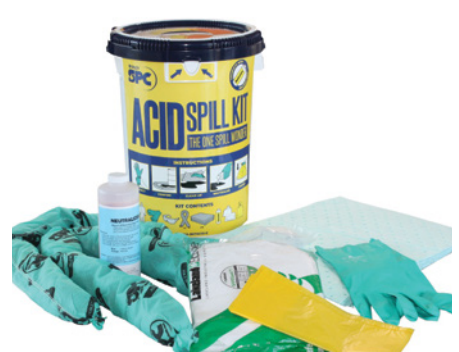
Spill Response Kits