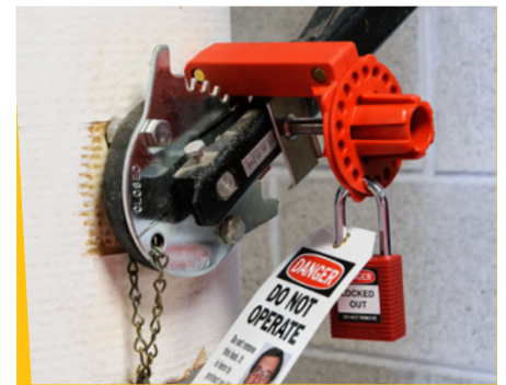
Butterfly Valve Lockout Devices