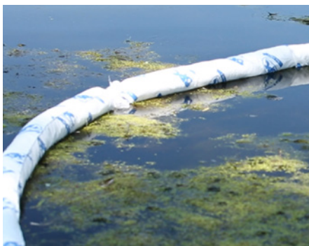
Absorbent Booms and Pillows