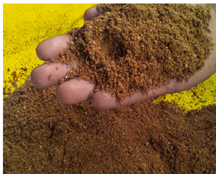
SpillFix® Granular Absorbent